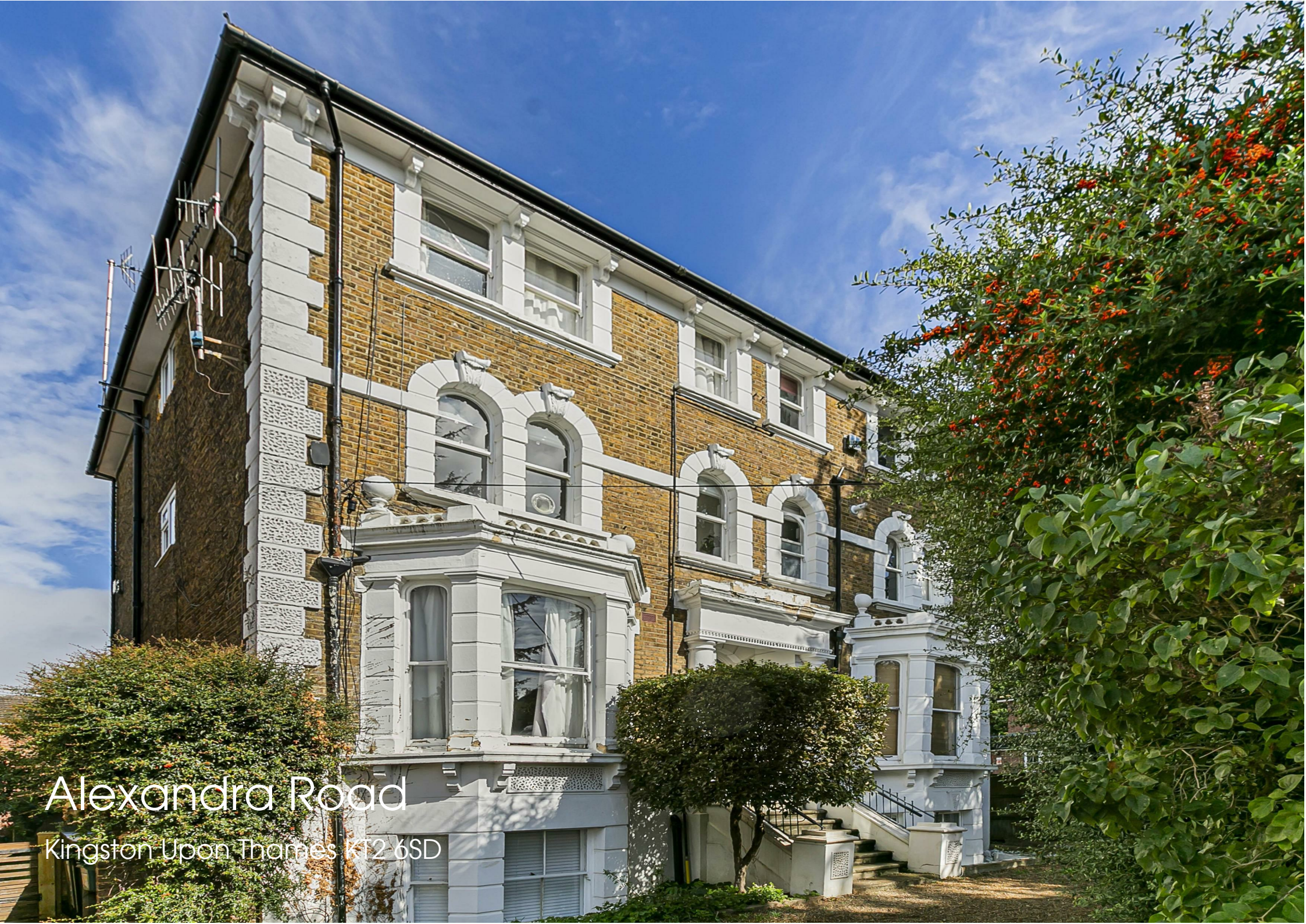
Alexandra Road Kingston upon Thames KT2 6SD